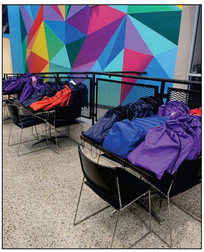
The Warford Activity Center gave away 120 backpacks stuffed with school supplies in early August.