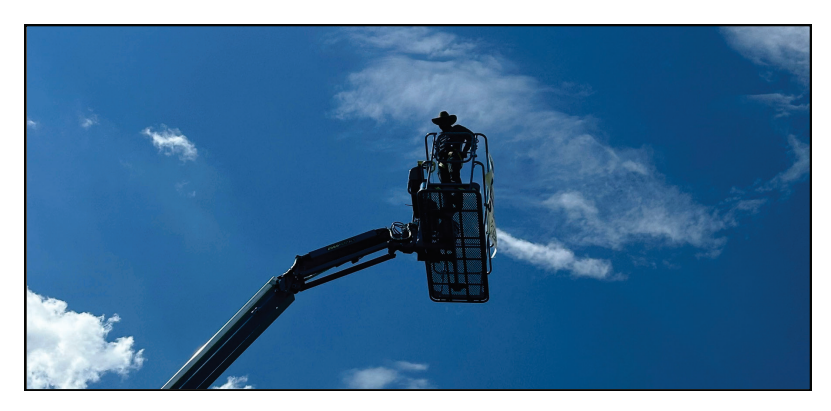
Heal the City Golf Ball Drop Special Thank You to the ASCO Company!